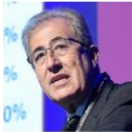
Maurice Buchbinder Foundation for Cardiovascular Medicine San Diego, USA